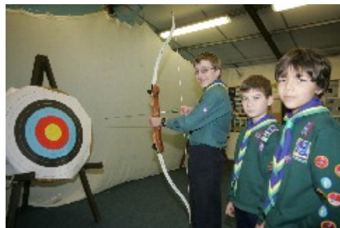
Some of the Cubs, Beavers and Scouts ahead of their marathon.

The event was organised by members of the Celts Cub Pack who are working towards their Caring Challenge badge. This badge involves raising money for a charity other than Scouting. The Cub Scouts chose WHR following an earlier visit to our studios.