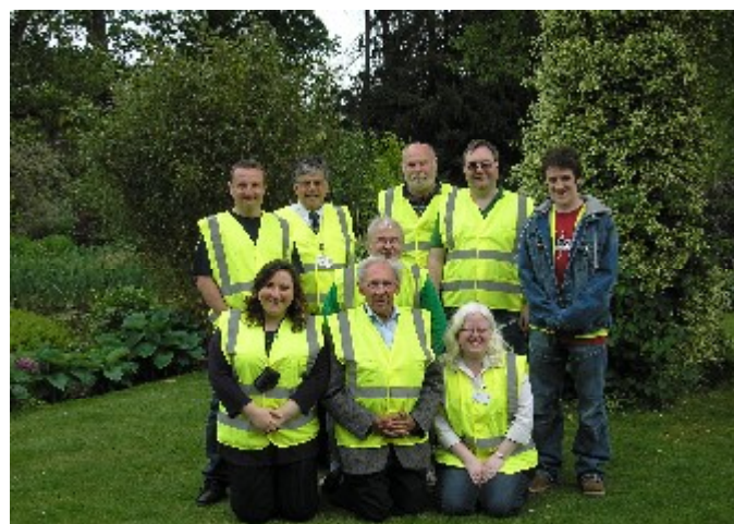
Left: WHR's team of volunteer car park stewards, entrance fee collectors and marshals at the end of the afternoon at Longstock Park Water Garden.

Longstock Park Water Garden, part of the Leckford Estate, near Stockbridge, was opened in aid of WHR on 6 th May, by kind permission of the John Lewis Partnership. Good weather ensured a large turn-out, with almost £2,000 being taken in entrance fees.