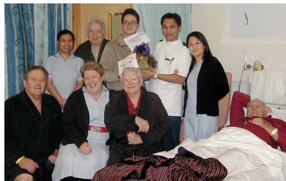
Patients and staff on Clarke ward celebrate winning the basket of fruit

Our visits, and the music requests we subsequently play, are welcomed by many patients. Over the year we have received numerous "thank you" cards from former patients. We even received a basket of fruit from a grateful patient, which we used in a prize draw the following day.