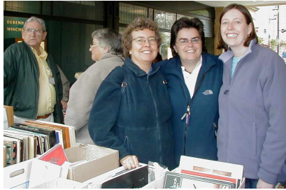
Left: WHR volunteers at the tabletop sale in St. Maurice Covert

Other fundraising events during the year included a tabletop sale at St. Maurice Covert in Winchester and a collection day at Hilliers garden centre in December.