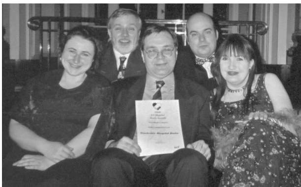
The WHR team after collecting the HBA Award in Liverpool

WHR's entry for the "Non-Music Programme" category of the annual HBA/BT national Hospital Radio Awards was judged "Highly Commended" at the awards ceremony at the annual conference in Liverpool during April.